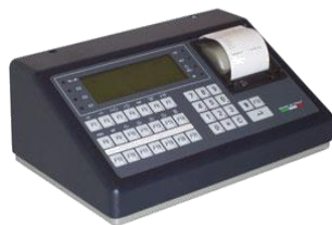
SE 511 AN-4R ST display LCD SE 511 AN-4R ST LCD Display