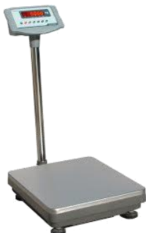
Bilancia da banco con colonna Bench scale with column