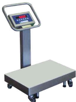
Bilancia Inox con ruote Stainless steel Scale with wheels