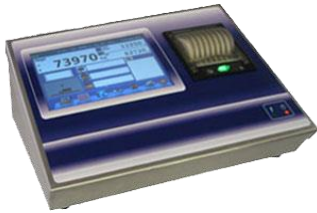
SE 500 TS AN ST Touch Screen SE 500 TS AN ST Touch Screen