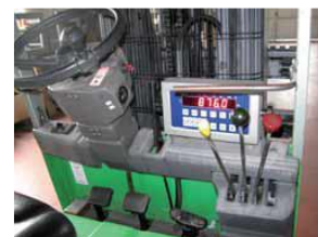
Carrello pesatura a forche frontali Weighing truck with frontal forks