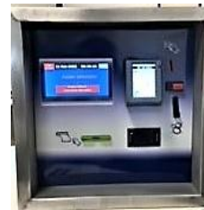
SE 511 SS Self Service SE 511 SS Self Service