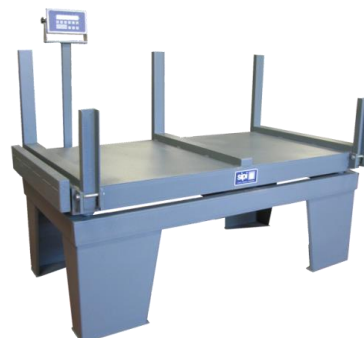
Bilancia pesa ferro Electronic scale for iron weighing