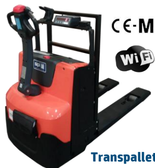
Transpallet elettronico con pesatura Truck with weighing system