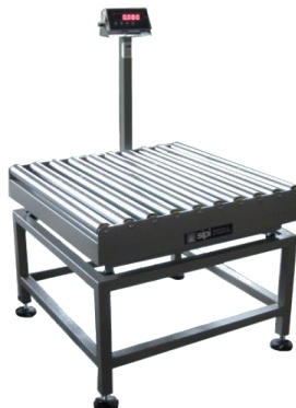
Bilancia con rulliera Scale with roller conveyor