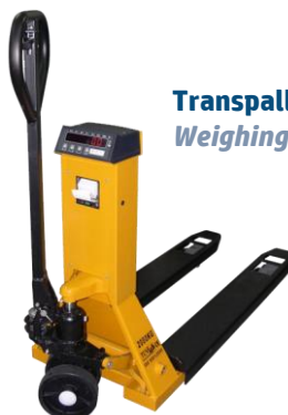
Transpallet pesatura Weighing truck