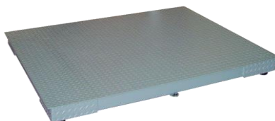
Piattaforma per bilance Platform for scale