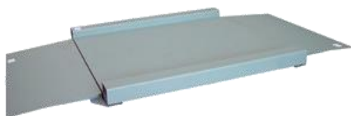
Bilancia a passaggio con rampe Scale with loading ramps