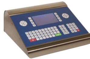
SE 500 AN Inox Grafico SE 500 AN Stainless steel version and graphic display