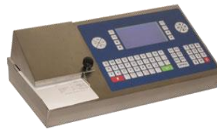
SE 500 I M290 Inox Grafico SE 500 I M290 stainless steel and graphic display