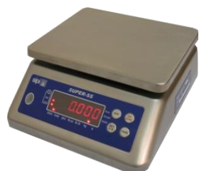
Bilancia da banco Bench scale