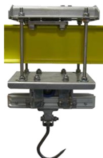
Bilancia aerea Overhead rail scale