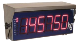
RIPETITORE SE 308 Inox Display H100 - IP 65 SE 308 I Repeater Stainless steel version H100 Display - IP 65