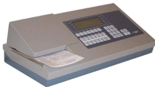
SE 511 AN-M-C SE 511 AN-M-C