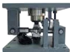
Gruppo di cella di carico Load cell unit